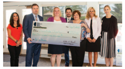
Downstate Chapter: $4,963