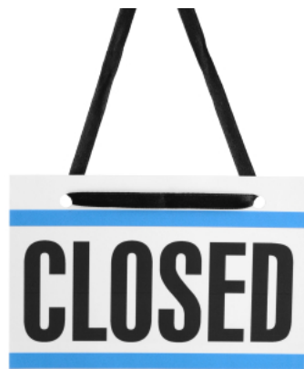
Exhibit Booth Applications are no longer being accepted. Mark your calendars for the 2013 Conference September 8-10, 2013

The 2012 Vendor Showcase with exhibit booths and five targeted opportunities to demonstrate products or services hosts the Sunday Welcome Reception and serves as the gathering place for conference participants throughout the day on Monday. The IGFOA Vendor Showcase features firms exhibiting products and services for government finance operations. Exhibitors may also reserve the Vendor Showcase demonstration area for a ten-minute slot during breaks to teach a mini-session, demonstrate a new product, or share a short case study. Exhibit Booths and Demonstration Time Slots are on a first in/first paid basis. Payment in full by check or credit card must be received within one week of submitting an application to reserve an Exhibit Booth. A Booth # will be confirmed at the registration desk on Sunday, September 9. Please include your firm name instead of booth # on all correspondence to the IGFOA and Best Expo.